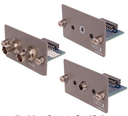
Headphone Connector Panel Options